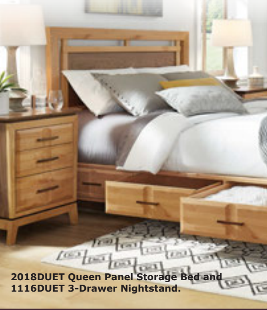
2018DUET Queen Panel Storage Bed and 1116DUET 3-Drawer Nightstand.

Whittier Wood FURNITURE Real Wood. Real Quality.