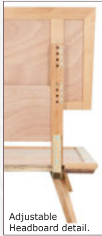
Adjustable Headboard detail.