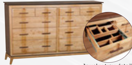
Jewelry tray detail.