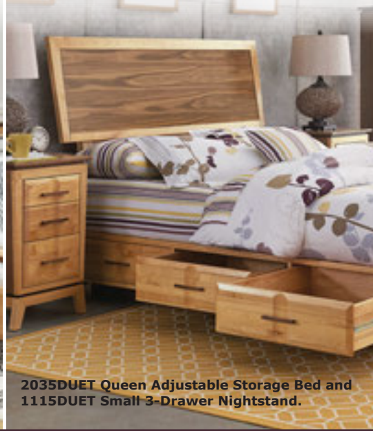
2035DUET Queen Adjustable Storage Bed and 1115DUET Small 3-Drawer Nightstand.