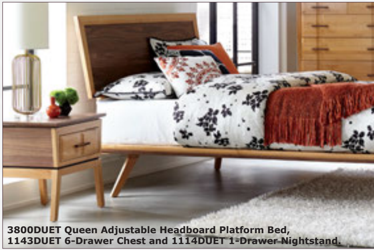
3800DUET Queen Adjustable Headboard Platform Bed, 1143DUET 6-Drawer Chest and 1114DUET 1-Drawer Nightstand.