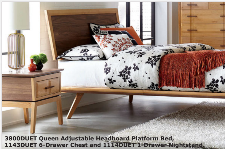
3800DUET Queen Adjustable Headboard Platform Bed, 1143DUET 6-Drawer Chest and 1114DUET 1-Drawer Nightstand.