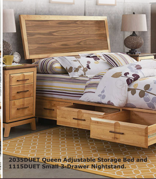
2035DUET Queen Adjustable Storage Bed and 1115DUET Small 3-Drawer Nightstand.