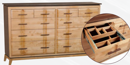
Jewelry tray detail.