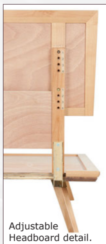
Adjustable Headboard detail.