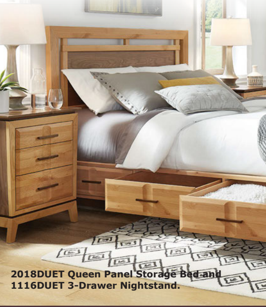
2018DUET Queen Panel Storage Bed and 1116DUET 3-Drawer Nightstand.

Whittier Wood FURNITURE Real Wood. Real Quality.