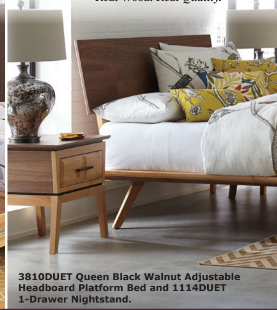
3810DUET Queen Black Walnut Adjustable Headboard Platform Bed and 1114DUET 1-Drawer Nightstand.

This collection was inspired by mid-century styling yet has a dramatic flair all its own. The remarkable combination of American Alder and Black Walnut hardwoods is stunning. Complementing this beautiful blend are bold design choices that set this group apart. A precisely engineered 45-degree miter face frame seamlessly surrounds spacious inset drawers. Coved drawer fronts exude solid wood and ensure the solid Black Walnut drawer pulls are a stand out feature. Beds offered in five styles for different design aesthetics. Made of American Alder and Black Walnut veneered hardwoods.