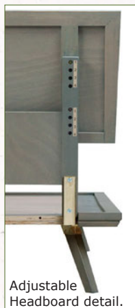
Adjustable Headboard detail.