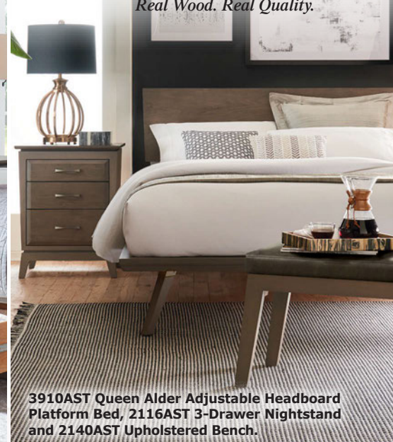
3910AST Queen Alder Adjustable Headboard Platform Bed, 2116AST 3-Drawer Nightstand and 2140AST Upholstered Bench.