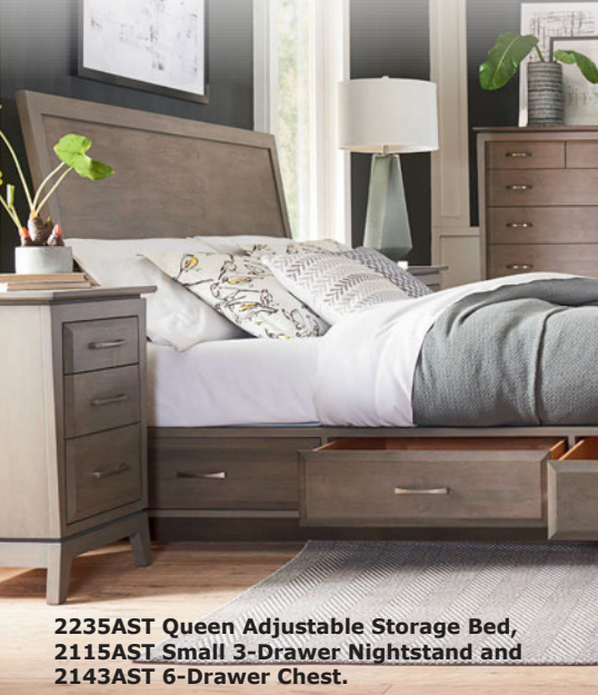
2235AST Queen Adjustable Storage Bed, 2115AST Small 3-Drawer Nightstand and 2143AST 6-Drawer Chest.