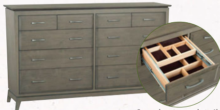
Jewelry tray detail.