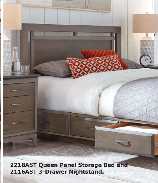
2218AST Queen Panel Storage Bed and 2116AST 3-Drawer Nightstand.