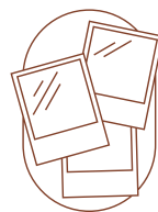
3 PHOTOS OF DAMAGE OR ISSUE